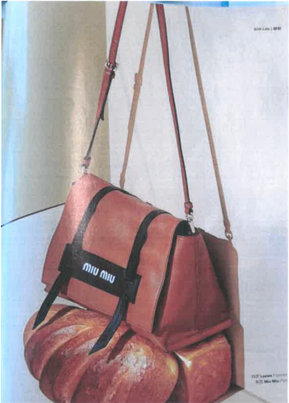
CHINA-THE NEW YORK TIMES TRAVEL-MIU MIU-05.18