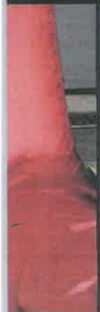
Vestido em linho bordado e algodão com seda, top em malha de seda, ambos MIU MIU . Na página ao lado: Vestido e casaco em plumas de avestruz, ambos ASMI ALTA-COSTURA .