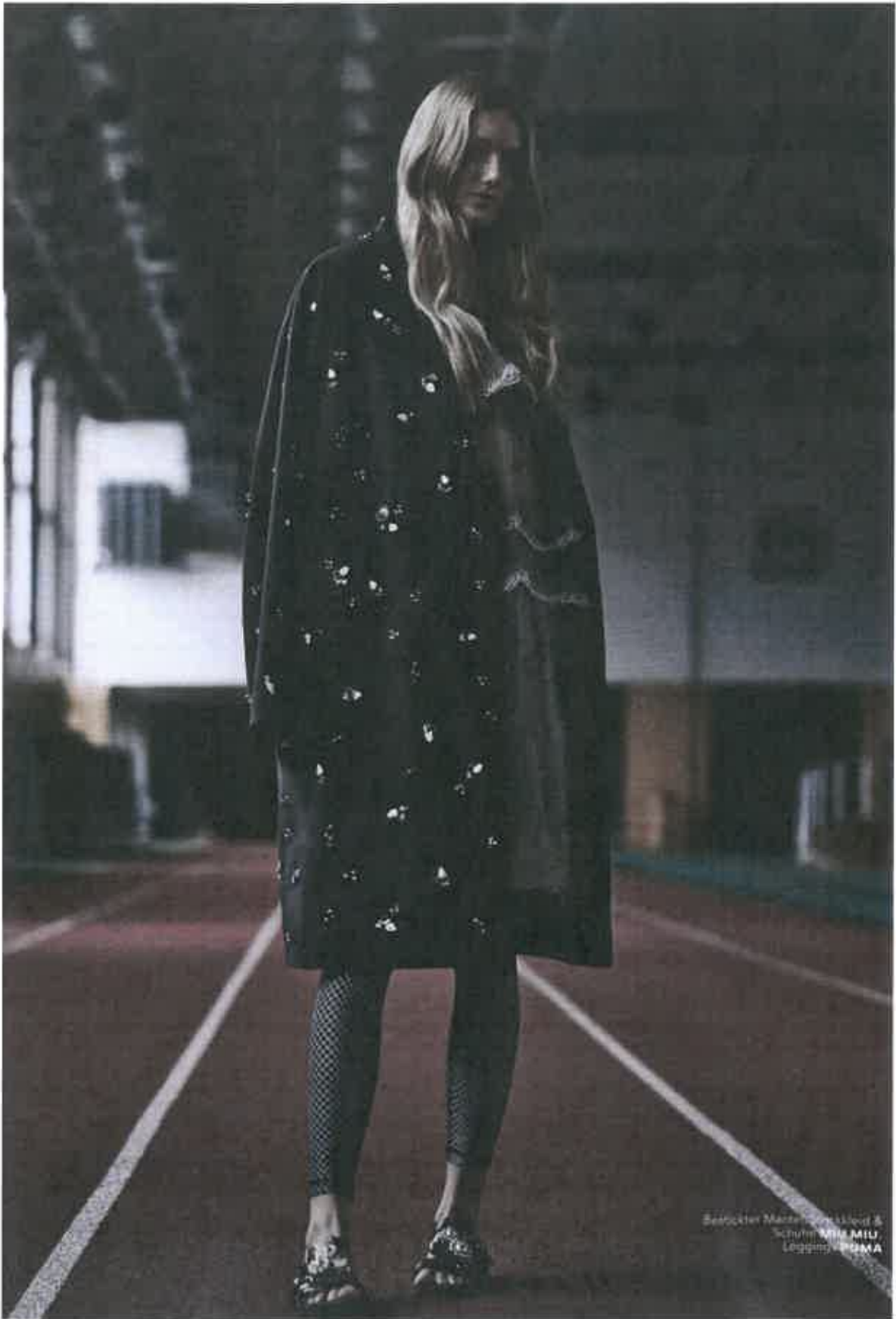
GERMANIA-L'OFFICIEL-MIU MIU-JUNE JULY-2018