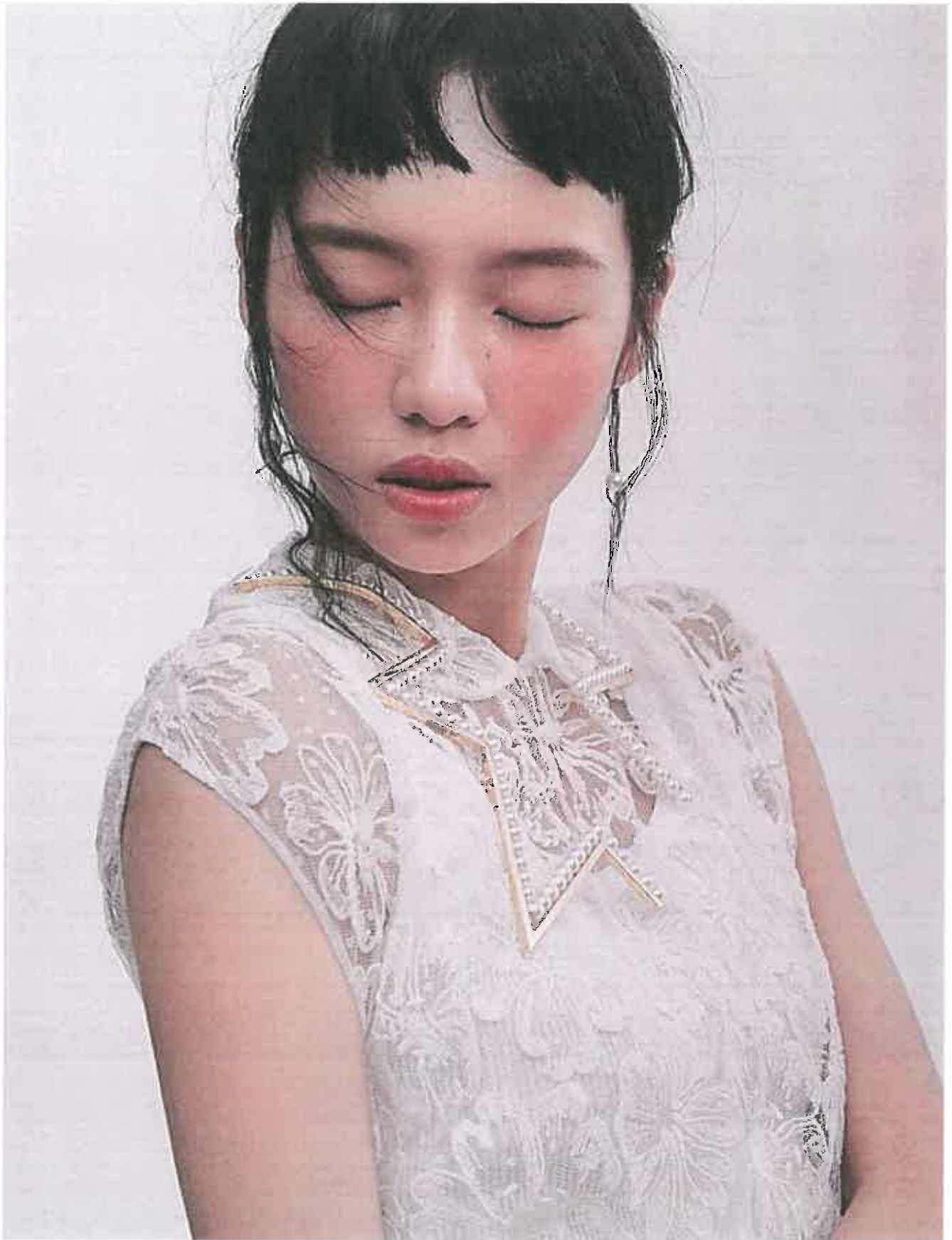
TAIWAN - VOGUE- MIU MIU - 05.04.2018