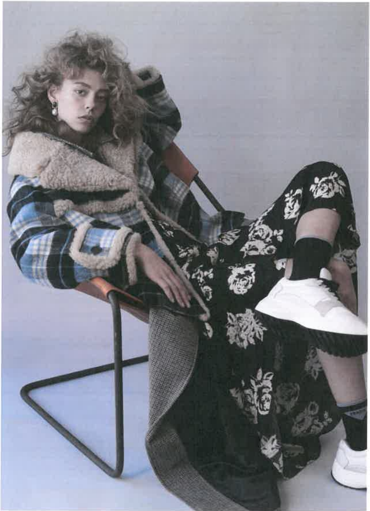
AUSTRALIA - MIU MIU - HARPER'S BAZAAR - JUNE/JULY