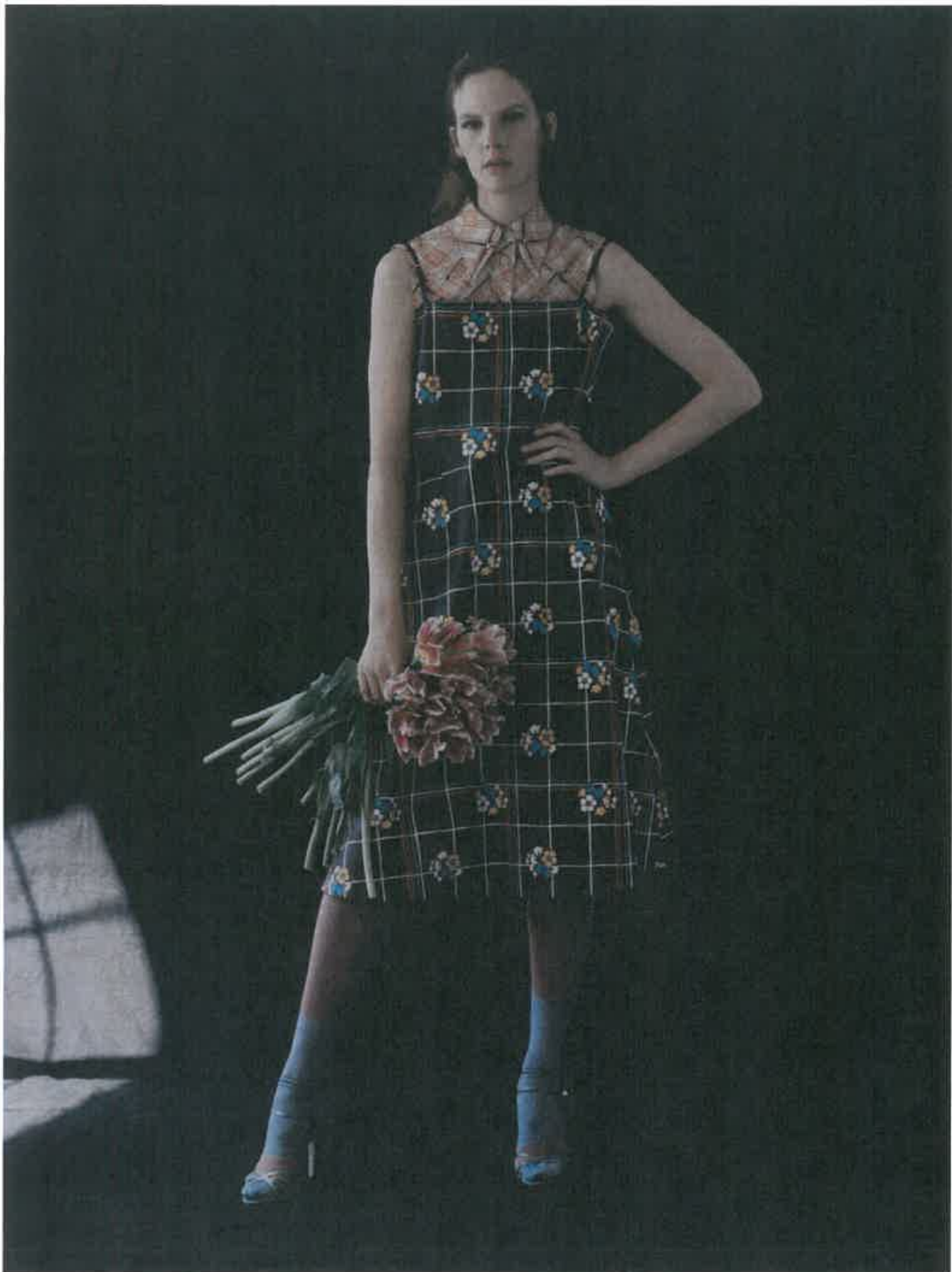
ITALIA - L'OFFICIEL - MIU MIU - 01.05.18.jpg