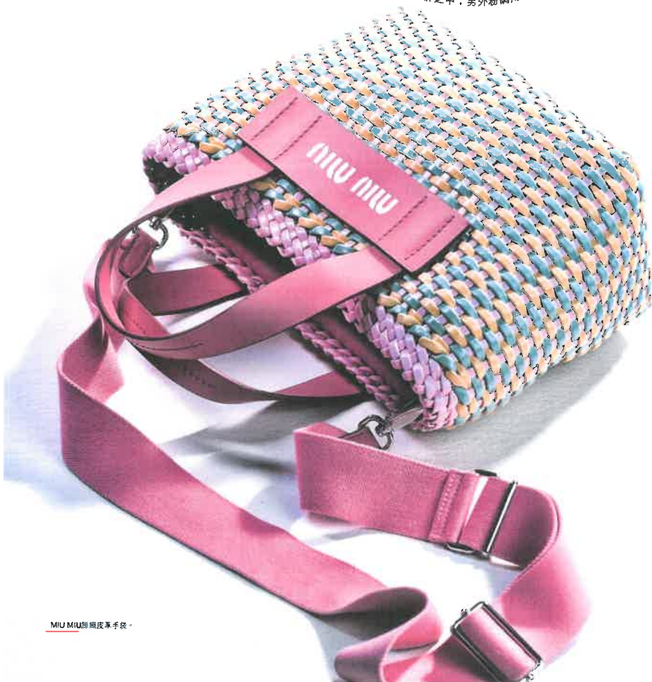
MIU MIU 藤織皮革手袋

利用皮革以藤織方法製作，將清新氣息注入設計之中；另外粉調用色亦是春夏的一大亮點。