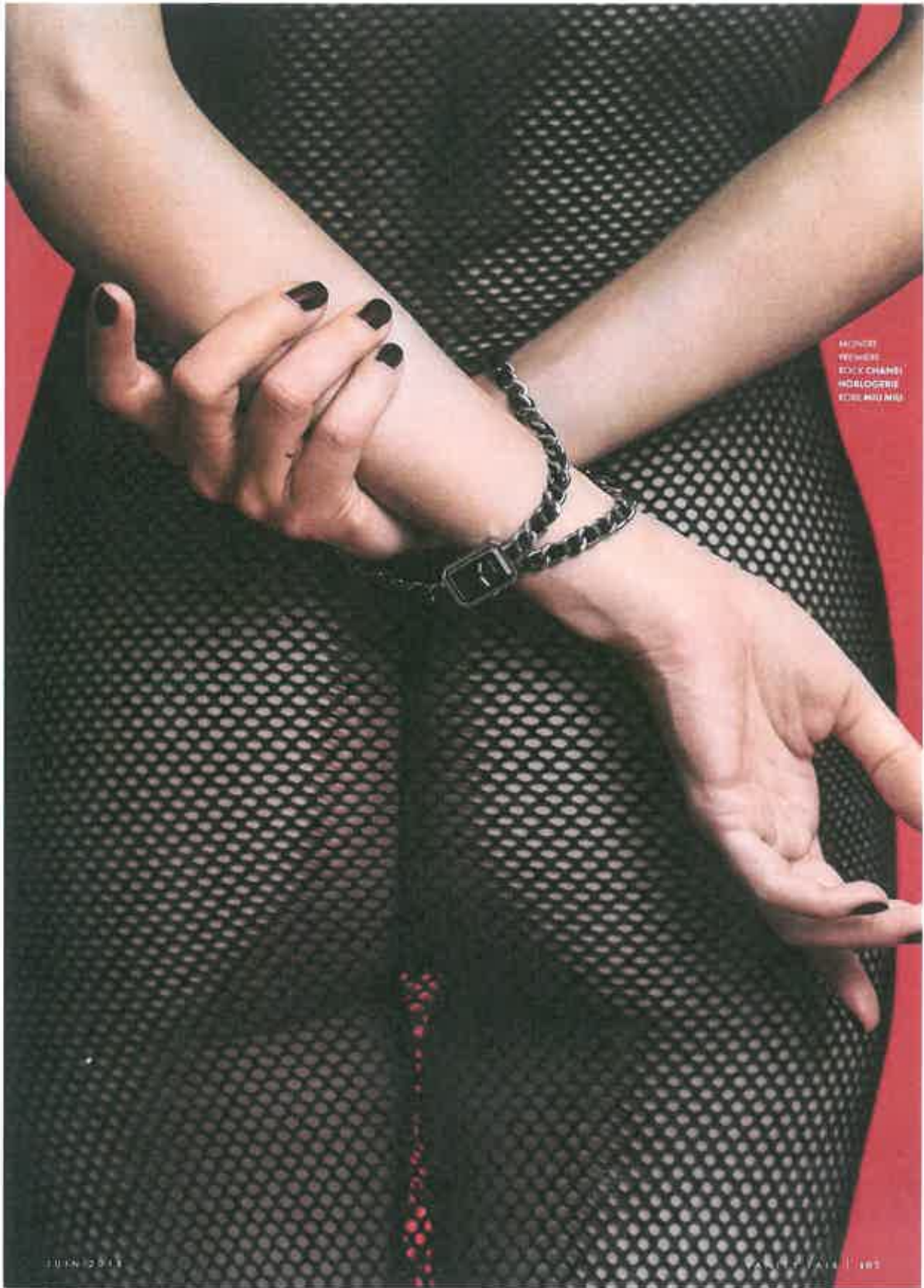
FRANCIA - VANITY FAIR - JUNE 2018