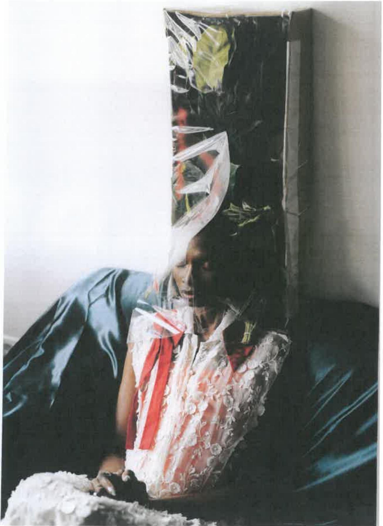
PORTOGALLO - VOGUE - MIU MIU - 01.05.18