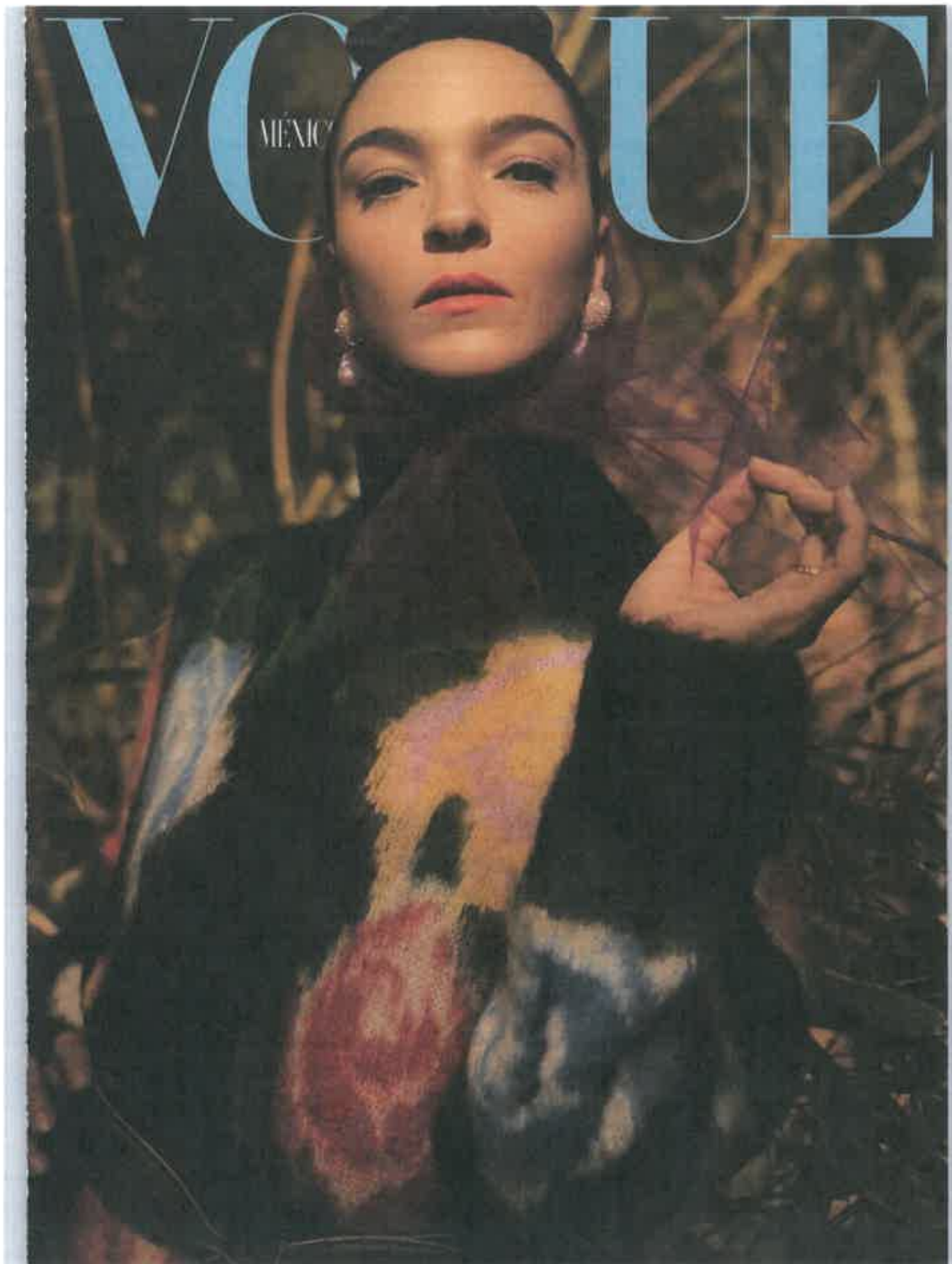
MESSICO - VOGUE MEXICO - MIU MIU - 01.05.18