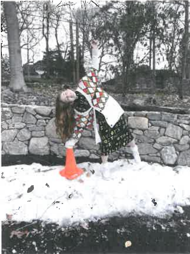
Left: Short socks and cardigan by Miu Miu. Trousers and shoes: Nobile Arsen