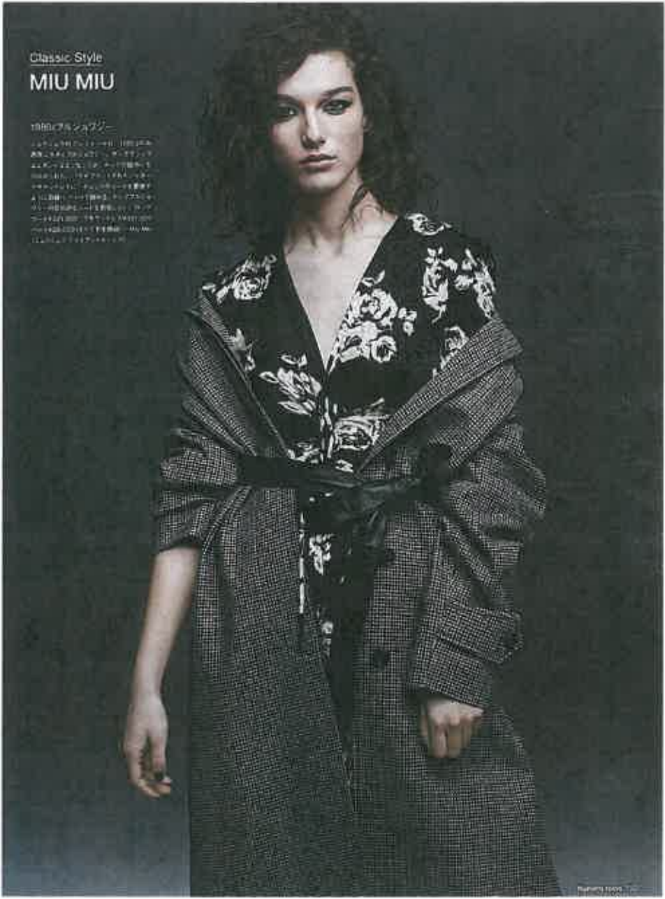
JAPAN_Numero TOKYO_MIU MIU_28.05.2018