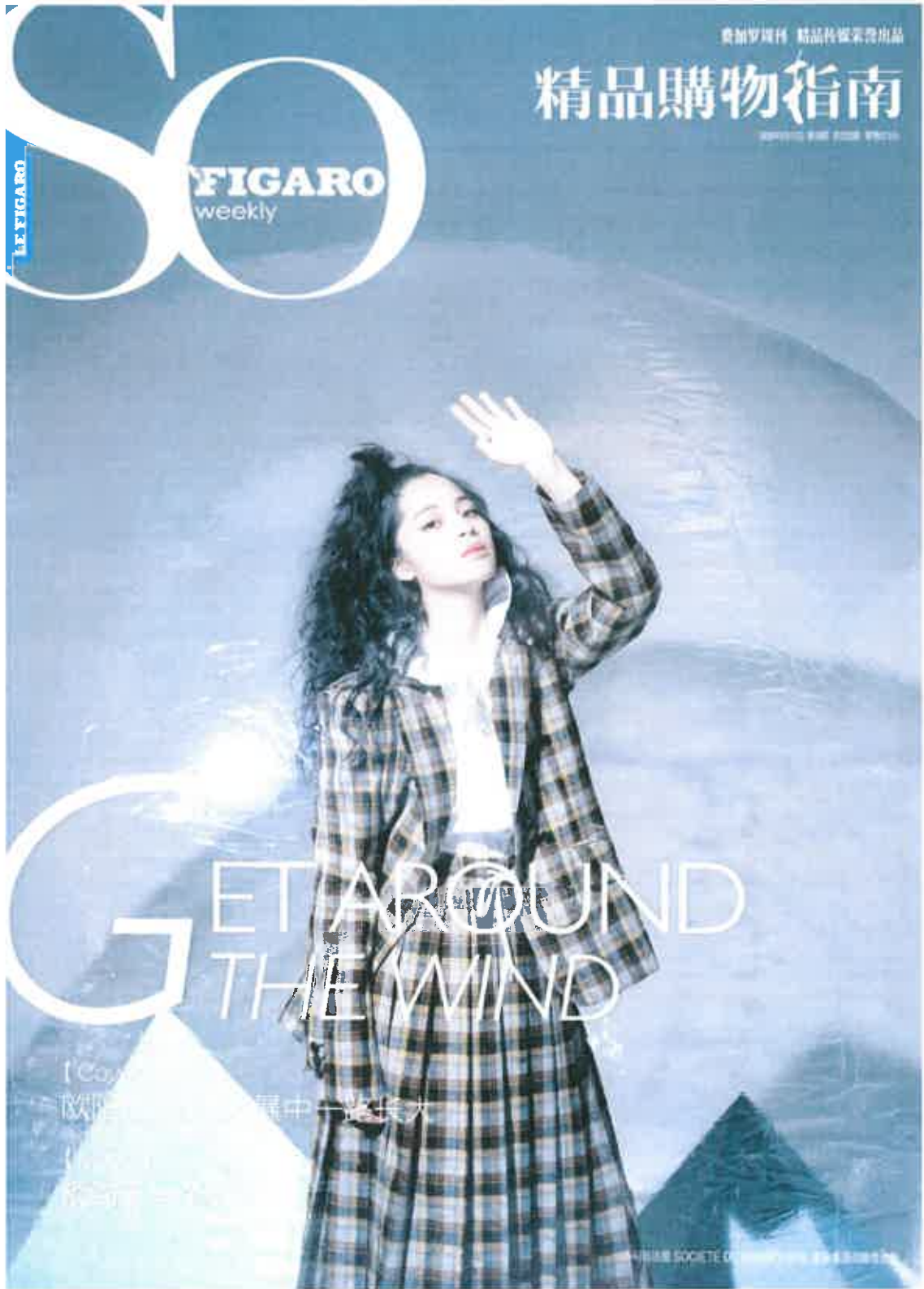
CHINA-SO FIGARO-MIU MIU-17.05.18