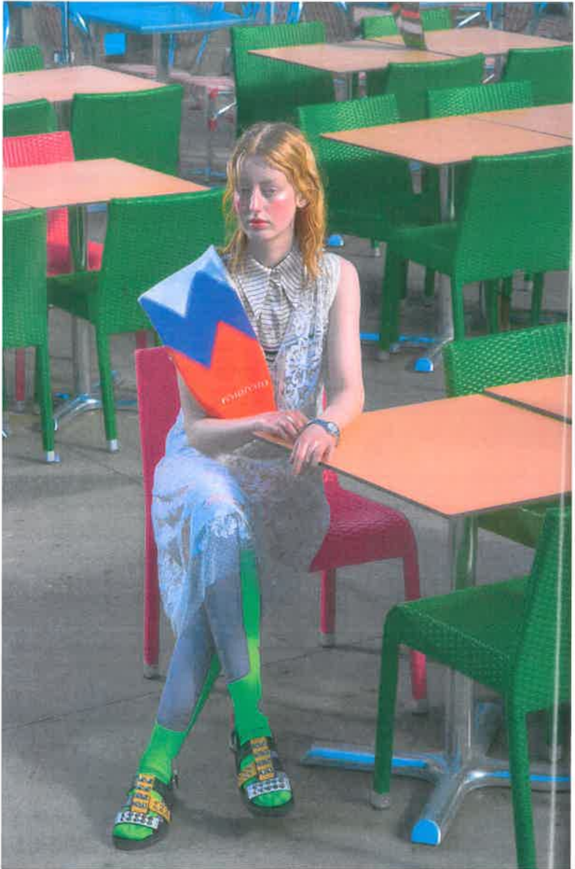
RUSSIA - NUMERO - MIU MIU - 01.05.-01.06.2018