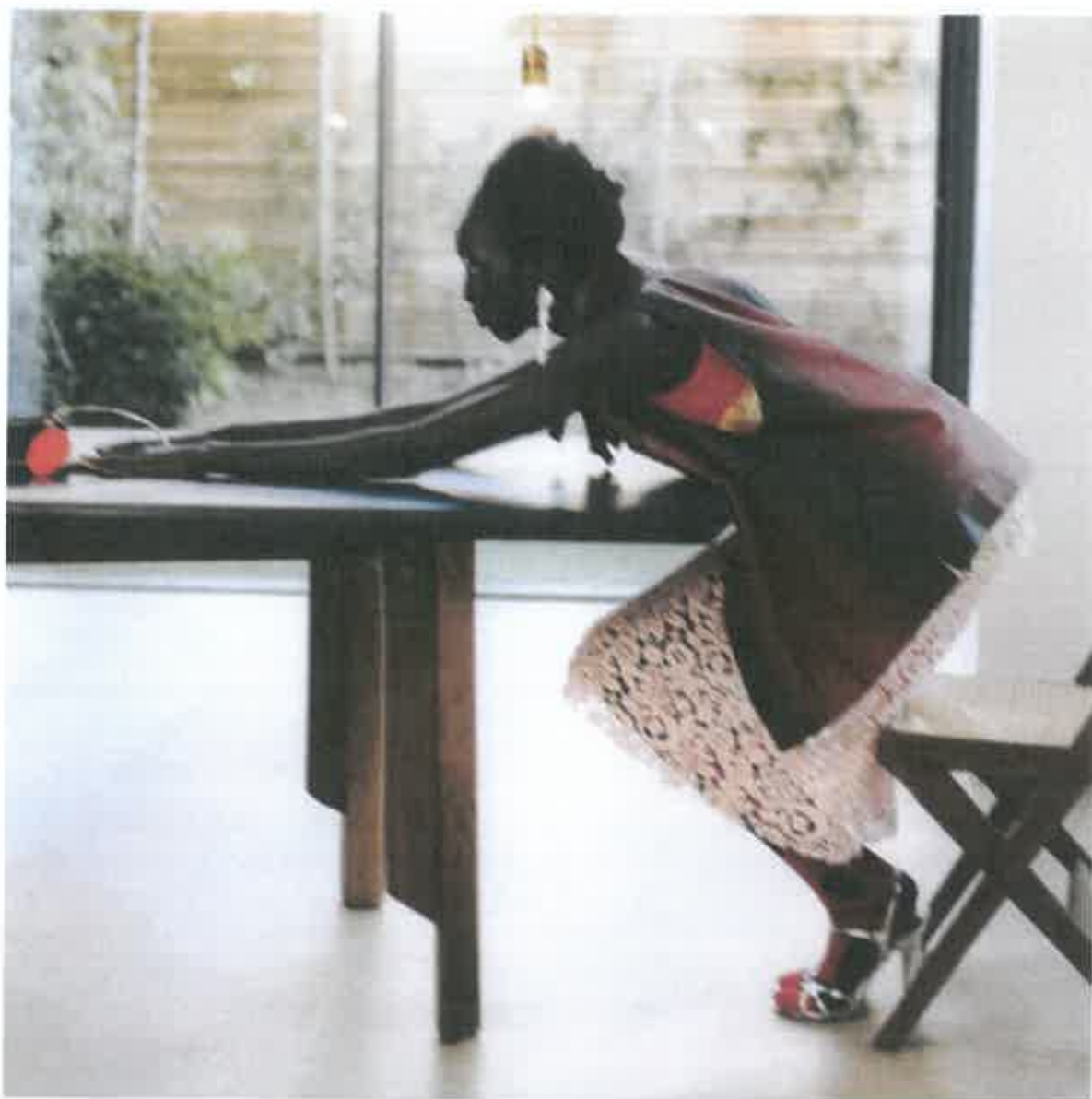
Colete em pele, top em malha, saia em renda de algodão, meias em mousse e sandálias em pele metálica tudo MIU MIU . Brinco em resina e pérolas CORNELIA WEBB . Carteira em pele e metal ROKSANDA . Na página ao lado. Vestido em macramê de algodão ACNE STUDIOS