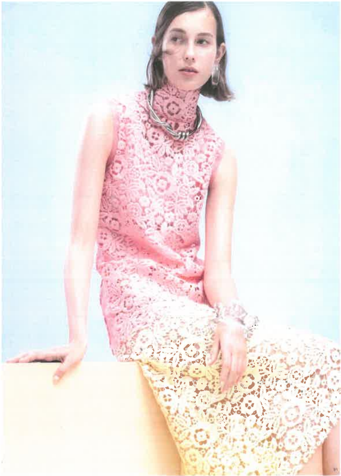
CHINA-HARPER'S BAZAAR-MIU MIU-05.18