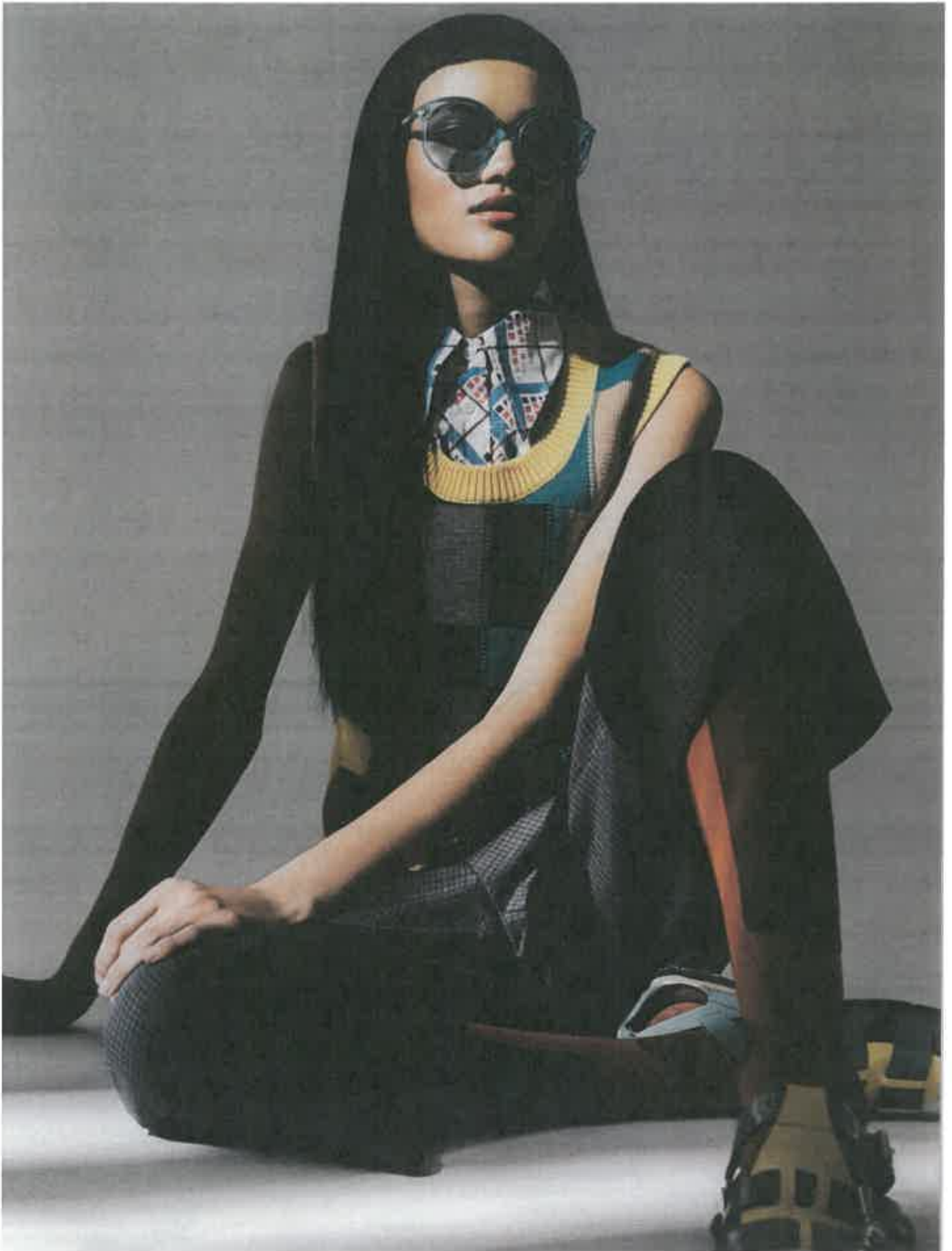
BRASILE - HARPER'S BAZAAR - MIU MIU - 01.05.18