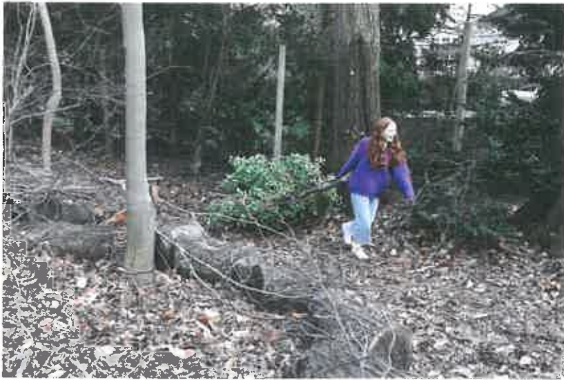
Sweater and jeans by Miù Miù Jeans and shoes Salvatore Ferragamo