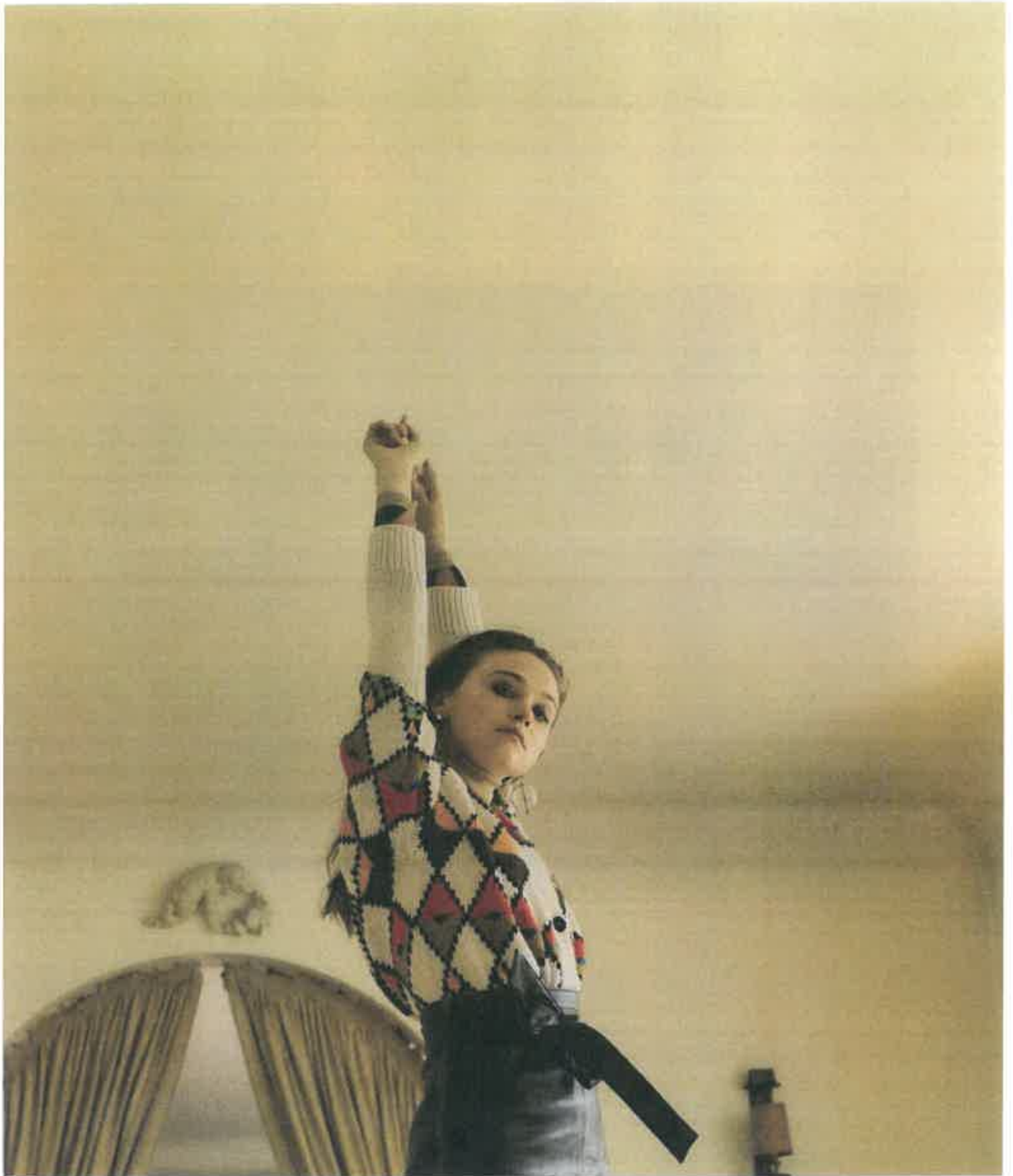
Cardigan di lana intarsiato multicolor, maglia di lurex color oro, gonna di pelle nera e fucsia di perle nere, tutto Miu Miu, orecchini: Sim Barrett in apertura. Camicia di seta e rete e cappello con rete, tutto Giorgio Armani